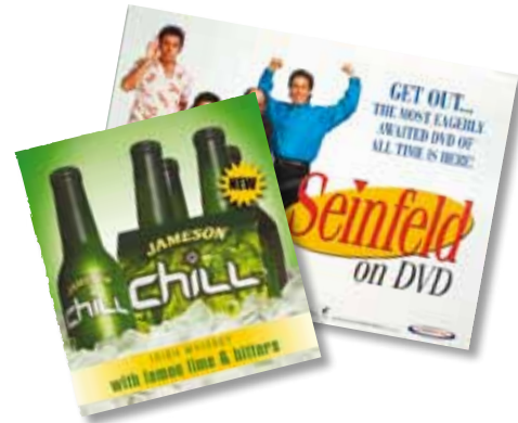
clingz & electrostatics